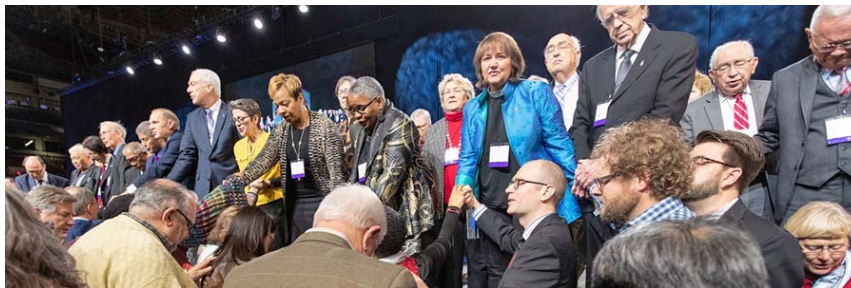
Protesters at the Called 2019 GC. Karen Oliveto is in the blue jacket.

At the called GC 2019 the first vote approved the means for congregations to leave the UMC and take their property. Delegates voted down The Simple Plan, the One Church Plan, and the Connectional Church Plan. The Traditional Plan passed and was then amended to make it harsher. It was finished, for the moment. We could see no way forward.