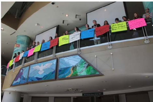
Progressive coalition protestors at GC 2019

The demise of the UMC at GC 2019 produced rumors of plans to let the church divorce itself, with progressives in one denomination and traditionalists in another denomination. To be truly fair, neither going forward should be allowed to call themselves "United Methodist" because we are now "Untied" Methodists. With each passing day, the split becomes deeper. COVID19 hit, and GC 2020 became GC 2021, August 29 to September 7.