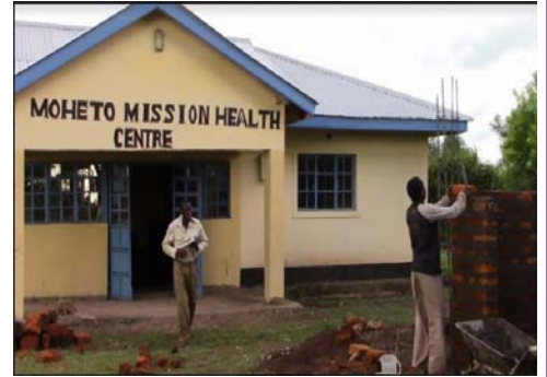
The center now has refrigeration.